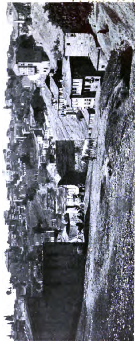
AN UNCONVENTIONAL VIEW OF PERA